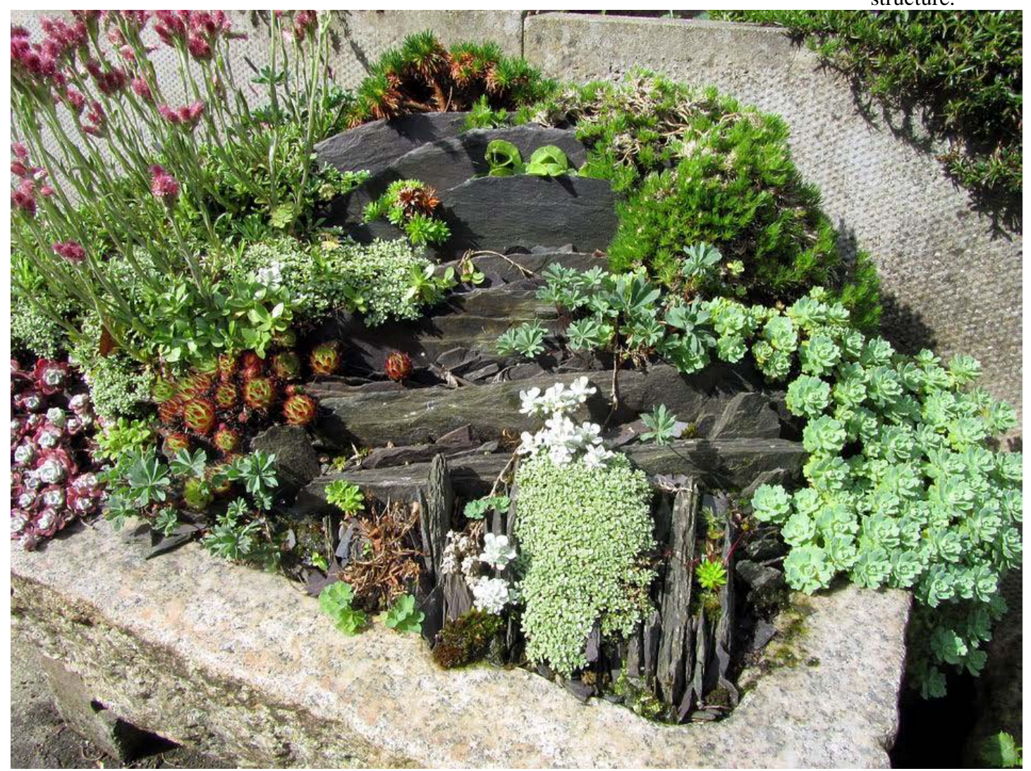
Maybe time and growth will come to dominate it and it will become a mound of foliage but for now I maintain a clear area showing the slate crevices.

Planted up with mostly quite common and easy alpines that are happy to grow with and through each other - the issue here is not to let the plants totally cover all the slate. A great mound of plants could look quite nice but I like to see at least some of the slate structure.