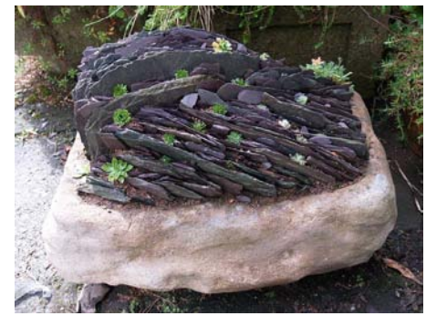
It now looks well colonised as the runners have each found spots to root into, sometimes with a little guidance from me. This continual search for a new spot to grow in, away from the parent rosette, is what this plant wants to do.