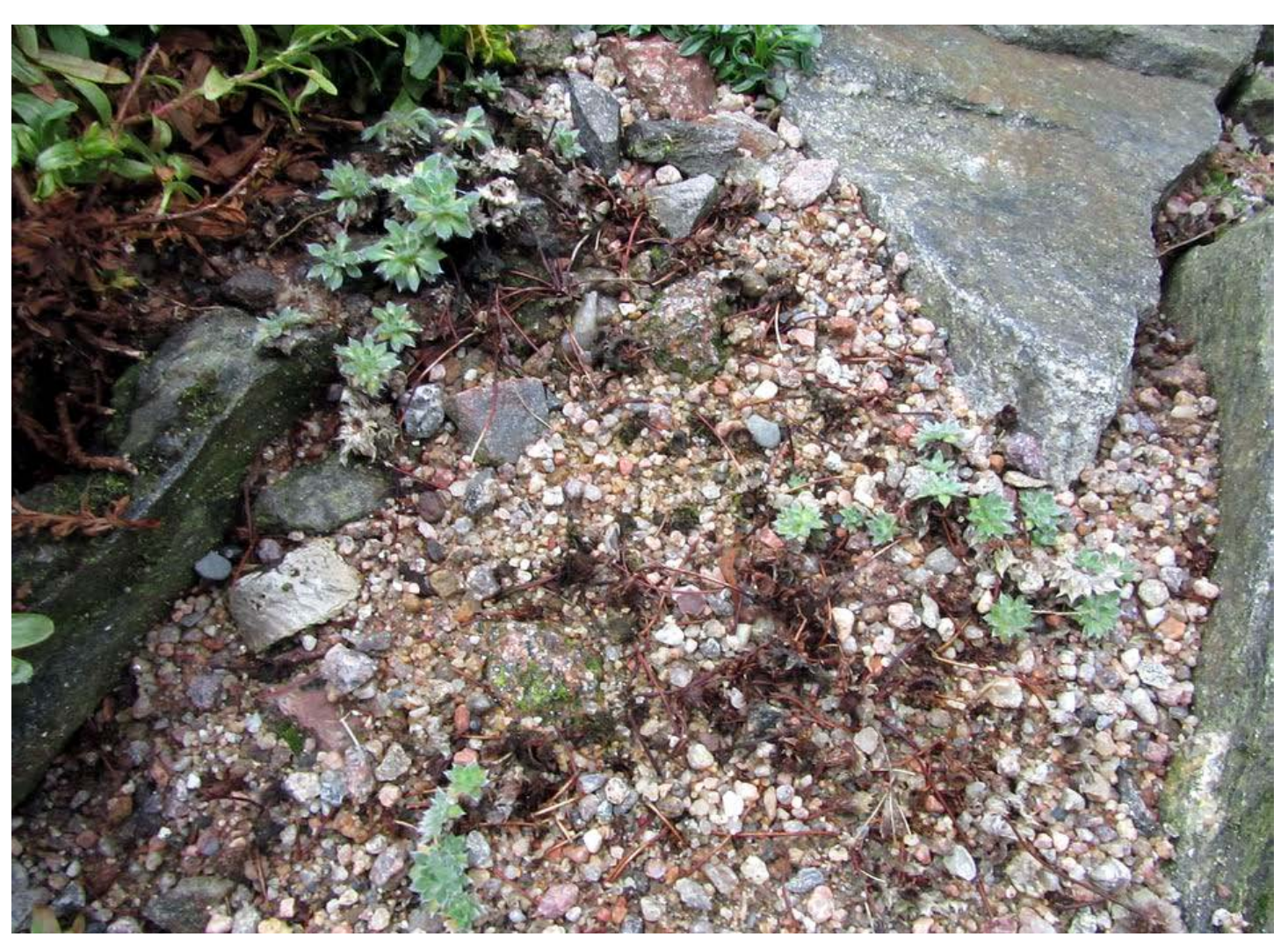
Hopefully each rosette will root and form the basis of a new plant but I must be prepared to expect this plant to seek new territory on a regular basis. Looking back, it was only when I grew these plants in pots which were regularly repotted and I managed the runners by removing them or fixing them in place that I have kept a good looking compact plant for any length of time that would be acceptable on the show benches.

While Androsace sempervivoides has survived reasonably well the other two have both suffered and practically died out in the centres of the plants with only a few areas of healthy growth around the perimeter towards the edge of the runners. This started me thinking that the runners may not be only a method of colonising new territory but also of survival. We expect plants to more or less stay where we plant them but what we see here is an example of a nomadic plant that wants to be continually on the move and, when you think about it, there are a lot of them around.