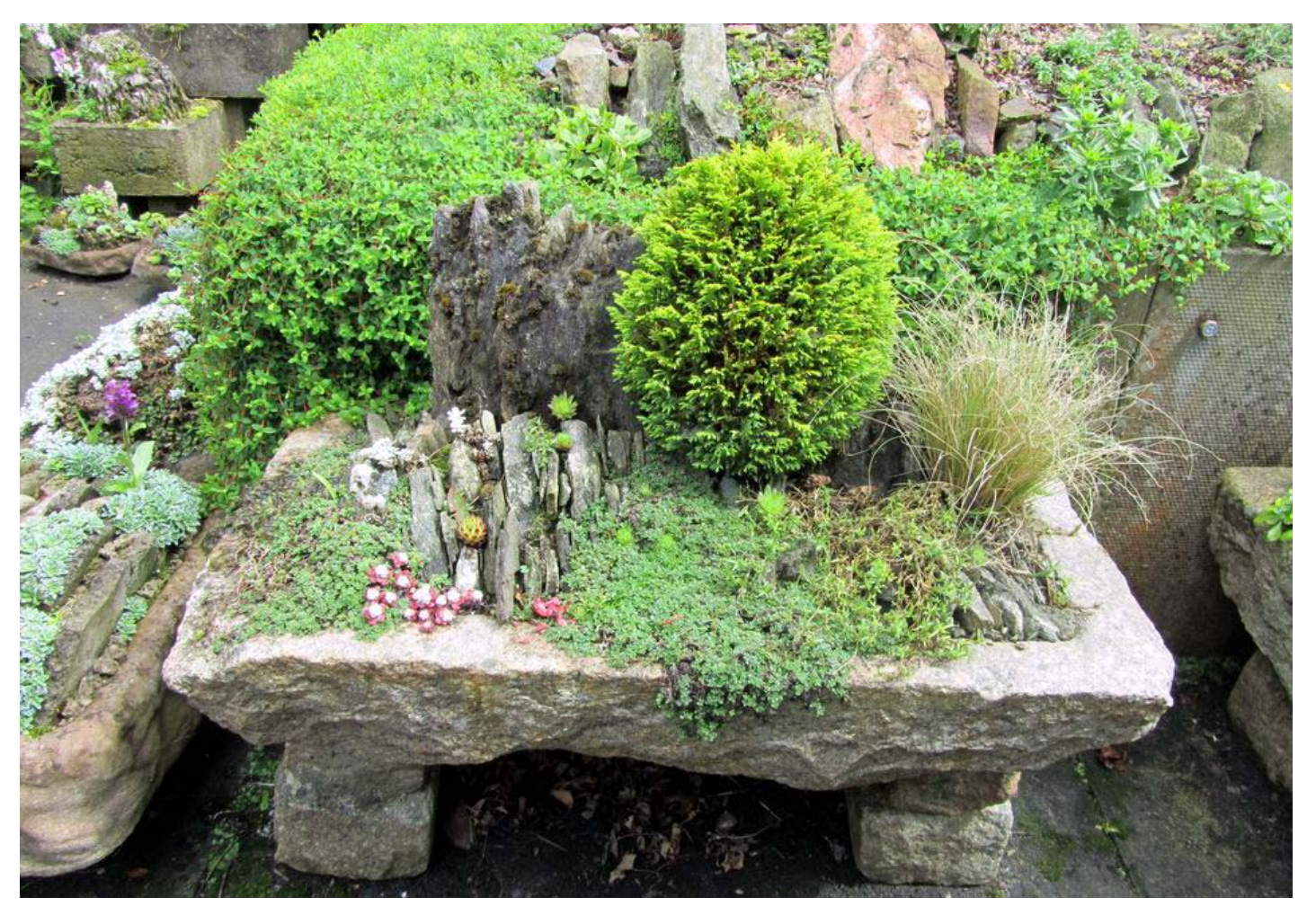
These next two troughs were landscaped a very long time ago and I basically just planted a rooted cutting of a dwarf conifer in each. All the rest of the plants have arrived by seed with the addition of the odd sempervivium or sedum rosette I find on the path, plucked off from another trough by a bird.