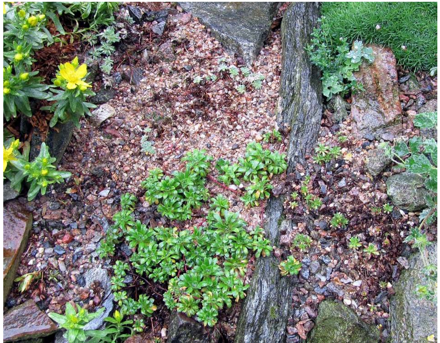
In an attempt to encourage the individual rosettes to root, especially the two that suffered great loss, I covered them over with some sharp sand earlier in the season.