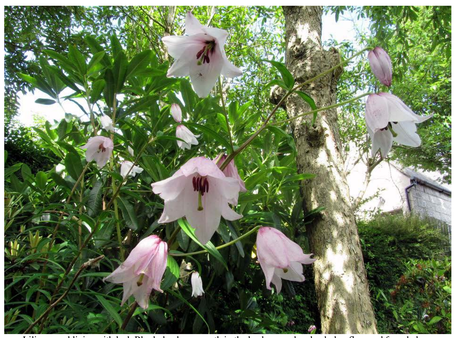
Lilium mackliniae with lush Rhododendron growth in the back ground and a darker flowered form below.