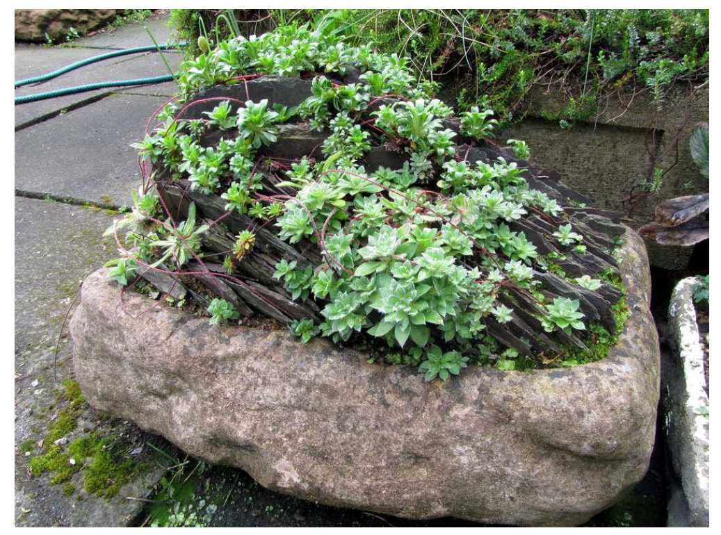
I created and planted this trough with Androsace runners two years ago.